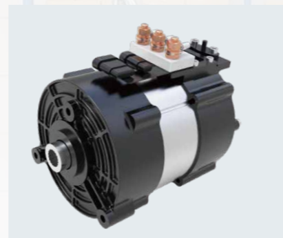
The AC Brushless Drive Motor