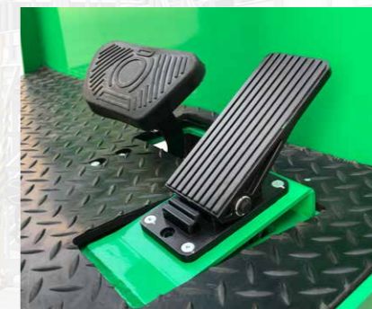
Large Brake Pedal with Integrated Parking Brake Design