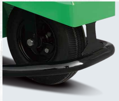
The Front Anti-Collision Bar