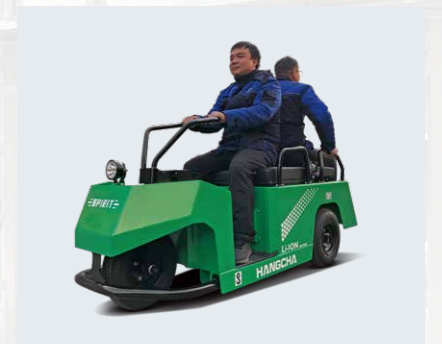
With the backrest folded down, the Electric Utility Vehicle can carry an additional person.