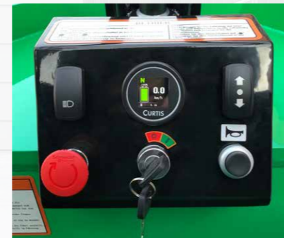
The ergonomically designed dashboard with a LCD color display instrument.